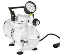
2019C-02 with vacuum gauge, regulator, catchport with shutoff valve (#2019K-04)