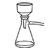
Buchner Funnel Filtration